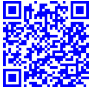
Portal Sign In