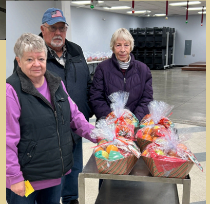
Enjoying the Christmas Party