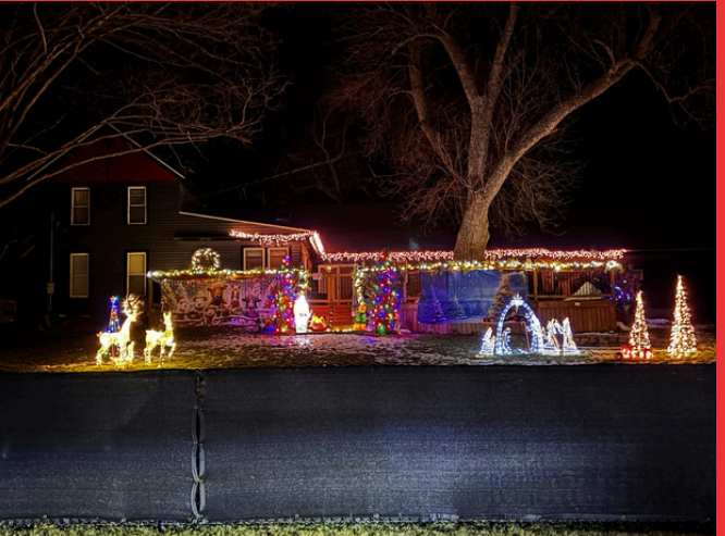
Second place winner